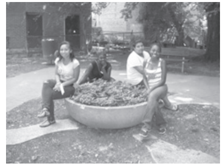
Lower Price Hill Youth transformed an empty lot into a vegetable garden this summer through the Summertime Kids grant

Summertime Kids Grant Program of The Greater Cincinnati Foundation -- for Santa Maria's Youth Program to provide resources to implement the neighborhood improvement projects in Lower Price Hill. By participating in this summer project, area youth transformed an empty lot into a