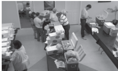
Volunteers for Santa Maria's Meals-on-Wheels program ready packages that are delivered to 130 individuals on a daily basis

Marge and Charles J. Schott Foundation -- in support of Santa Maria's Meals-on-Wheels Program to help with administrative costs.