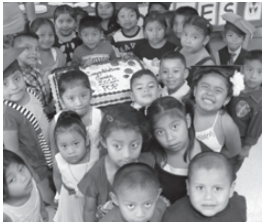
A happy group of Hispanic preschoolers celebrates their graduation to Kindergarten