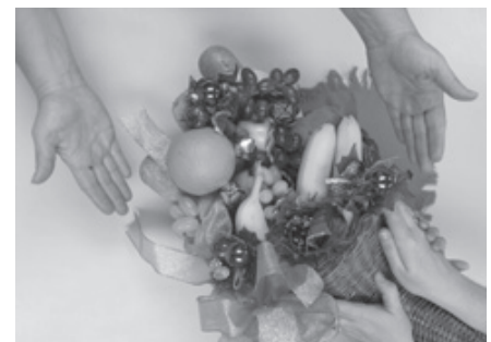
Santa Maria's Meals-on-Wheels program celebrated 40 years in 2012