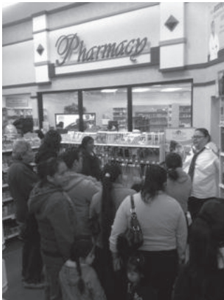
Moms from IWC tour Kroger

Join Santa Maria's International Welcome Center (IWC) Coffee Hour moms and families in supporting Santa Maria by shopping at Kroger! During a recent coffee hour gathering, the IWC group visited the local Price Hill Kroger and signed up to receive the Kroger Plus Card. Now they are supporting Santa Maria!