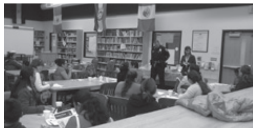
Safety issues was the topic at a recent Coffee Hour

For more information about Santa Maria's International Welcome Center contact 513-363-4693.