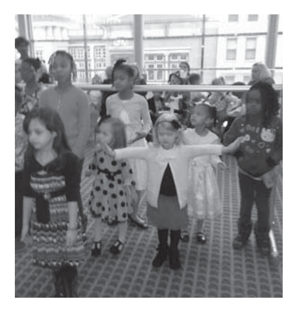
Enjoying an impromtu ballet lesson with the Cincinnati Ballet

The children arrived early for music, snacks and activities in the lobby. They even took a quick dance lesson with a real ballerina. It was a night they will never forget!