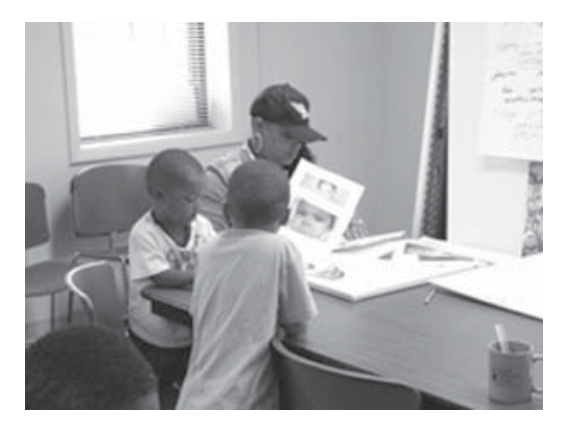
Families worked together to make collages of their photos

Clients and their families took a photography walk around the neighborhood to capture images that were representative of their experience in Price Hill, and what they vision for the future of the neighborhood.