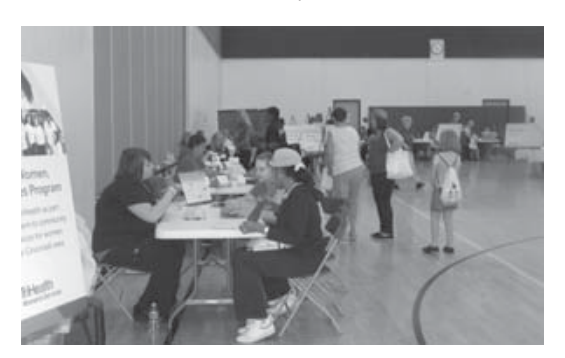
Many volunteers help make the Price Hill Women's Health Fair run smoothly! Thank you to all who helped!

Fair: More than sixty people gathered to make the 2013 Price Hill Women's Health Fair successful this year! Since the Price Hill Recreation Center was closed for renovations, the fair was held for the first time at Roberts Academy.