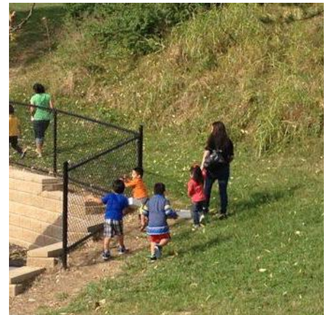
Santa Maria's POP program enjoyed the great outdoors!