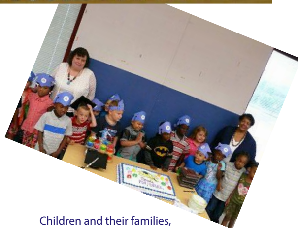
Children and their families, who participate in Santa Maria's POP and SPARK programs, celebrated their readiness for kindergarten!