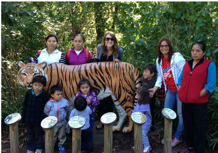
Santa Maria's Family Child Care program visited the Cincinnati Zoo this fall.

The small group component of Santa Maria's Promoting Our Preschoolers (POP) program took a nature walk with the Hispanic parents and families this fall. During the walk, families matched colors in nature along with other fun activities. One mom even brought homemade tamales for the group to share!