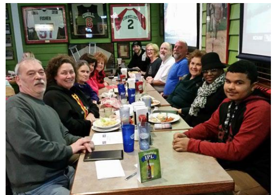
Members of the Price Hill Pacer Training Group enjoyed some social time during the Holidays