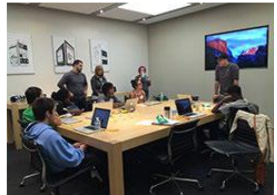
Santa Maria GED students learn how to tell a personal story in a creative way with Apple's Pages program.

At the end of the training, the students presented their story to the class, and for some, this was the first time that they presented something to a group.