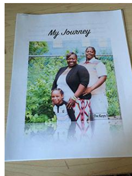
A finished product

computer training class at the Kenwood Mall Apple store. The business team at Apple has recently begun a community outreach program, where they work with organizations in the city to provide meaningful experiences that foster creativity. These trainings also expose members of the community to different Apple technologies that can support their organization in many different ways. The Apple store in Kenwood is one of 28 stores throughout the country to have training space available on-site.