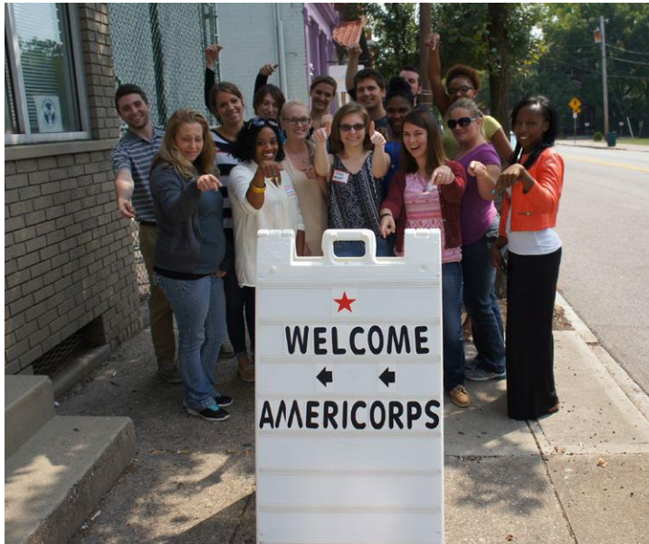
Santa Maria's AmeriCorps program welcomes its new members for 2015-16