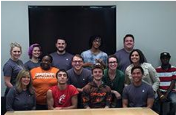
Thank you to the staff at the Kenwood Apple store for sharing their expertise with Santa Maria's GED students!

During the second week of October a handful of Santa Maria's GED students attended a