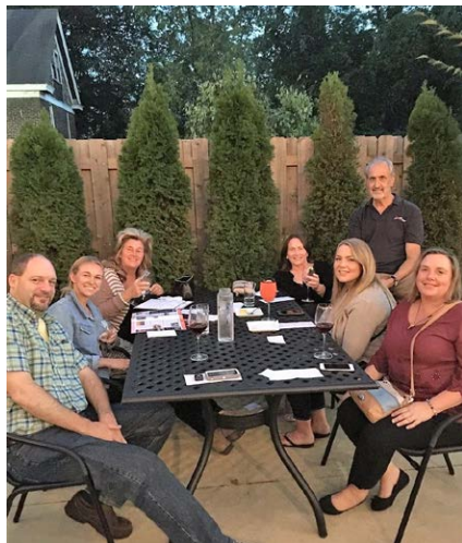
New and old friends of Santa Maria enjoy the patio at SOMM Wine Bar during the SOCIAL-izing at SOMM event.