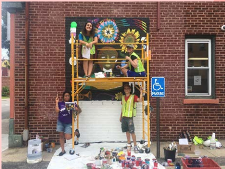
Volunteers painting the mural at Santa Maria's 3301 Warsaw Avenue location

The project included five community engagements to get the community involved by creating art related to the mural themes. By bringing the community together, the project aimed to bridge cultural divides, to build empathy and deepen cultural understanding. The goal of the mural project is to not only create an enjoyable atmosphere in Price Hill, but also to tell stories and build cultural unity.