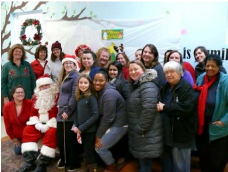
Staff from Santa Maria pose with Santa during the 2016 Holiday on the Hill event

On Thanksgiving Day, Thursday, November 23, Price Hill will host the 27th annual Price Hill Thanksgiving Day Parade. The parade will take place on Glenway Avenue in West Price Hill beginning at 10 am at Western Hills High School, and include marching bands, community and school groups and more before ending at St. Lawrence Church on Warsaw Avenue. Various family-friendly activities will take place at St. Lawrence Church,