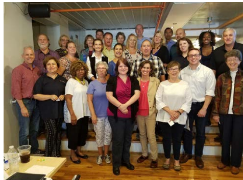
Santa Maria 2017 Board of Directors and Staff