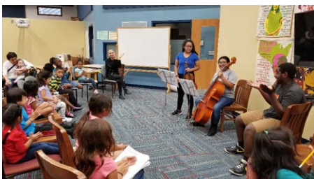
Santa Maria's International Welcome Center's Youth Enrichment Program

This September Santa Maria's International Welcome Center (IWC) welcomed 122 adult students to its 2017-2018 English for Speakers of Other Languages (ESOL) program at Roberts Academy. Santa Maria is excited to announce 46 children have also been enrolled in Santa Maria's Youth Enrichment program, which provides activities for children while their parents attend ESOL classes. The Youth Enrichment program has several exciting