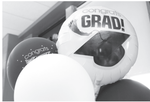
LCW Students will celebrate at the 14th Annual Graduation Ceremony on June 6th

On June 6, 2013 the Literacy Center West program of Santa Maria Community Services is hosting its 14th Annual Graduation Ceremony from 6-7:30 pm at Elder High School's Schaeper Center.