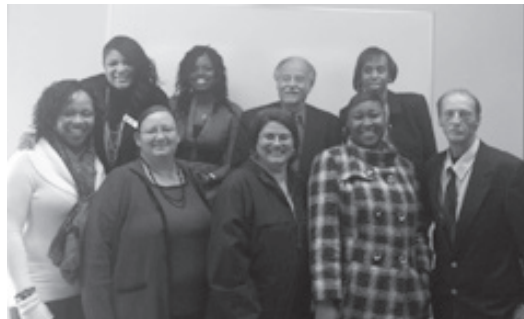
Employment Workshop graduates celebrate the completion of the employment workshop

"I had been praying for someone to mentor me, to help me know what to say and what to do," said one of the recent Employment Workshop graduates as she struggled with direction for her job search.