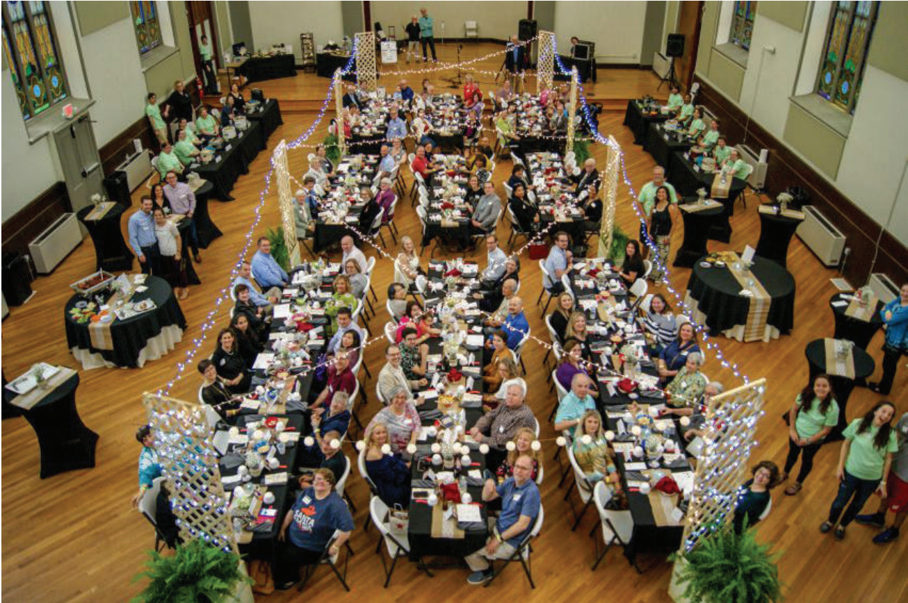
Santa Maria holds the first annual The Sharing Table at The Sanctuary in Lower Price Hill

The Sharing Table, Santa Maria Community Services' first annual community dinner and fundraiser, took place April 13 at The Sanctuary in Lower Price Hill. The event offered a unique experience for all guests, while celebrating the community and raising awareness for childhood poverty in the area.