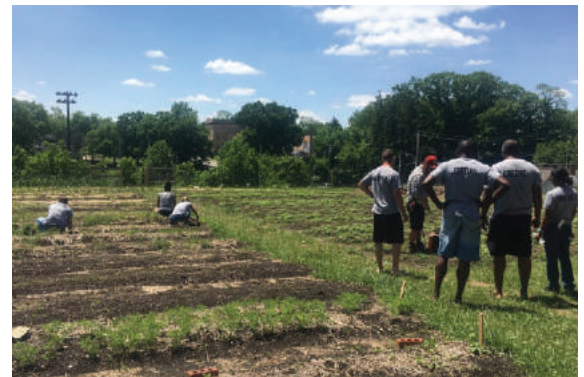
Officers volunteer in library garden