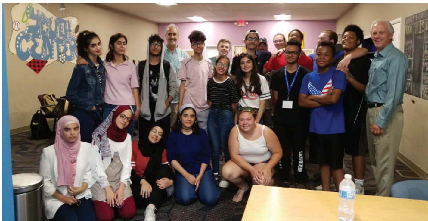
Iraqi teens visit Santa Maria's Youth Development Program through Iraqi Young Leaders Exchange Program

"The kids found out more ways they were similar than different, even though they live on opposite sides of world."