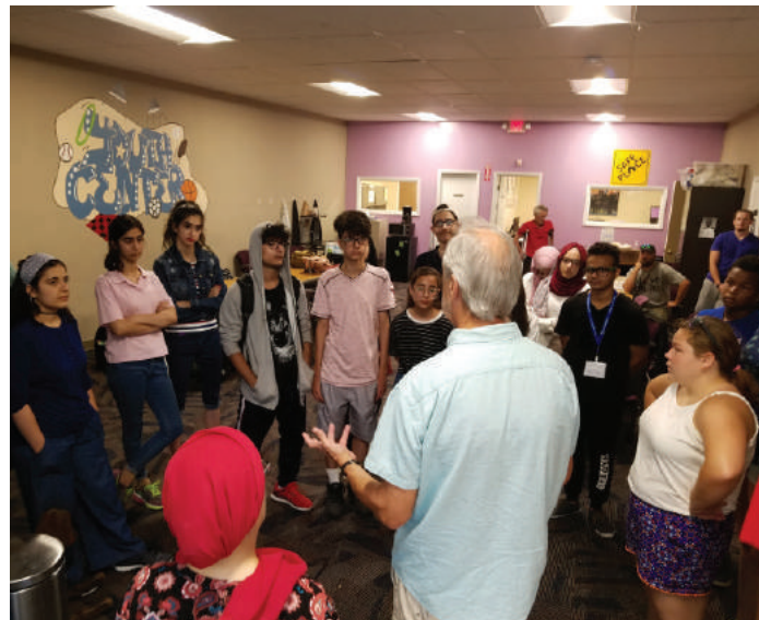
Iraqi teens are introduced to Santa Maria's Family Center