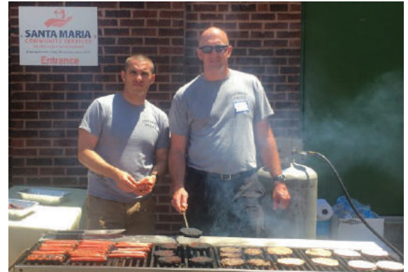
Officers grill food for community cookout

During the cookout, community organizations including Healthy Moms and Babies, the Salvation Army human trafficking program, Rees E Price, the Price Hill Recreation Center, the Price Hill Public Library, and event partner, Price Hill Will, offered resources for community members.