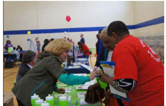
Price Hill residents benefitted from the free health screenings offered at Santa Maria's Spring Health Fair

Ohio Commission on Minority Health for their continued support of Santa Maria's Health Fairs through the years.