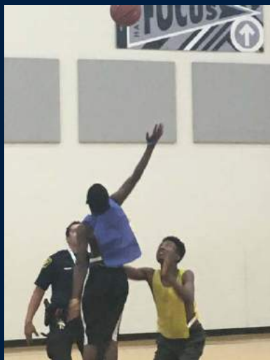
We Are Family basketball tournament

Along with the tournament, youth and participants enjoyed pizza and yard games. Those who attended the event received a bracelet, and the winners of the tournament received medals. The event offered a way to bring the community together with fun and friendly competition while engaging the youth with officers and firefighters.