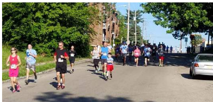
2017 Price Hill Pacer

Interested runners and walkers are welcome to join the year-long Price Hill Pacer training group. For more information on the training group, visit www.pricehillpacer.org .