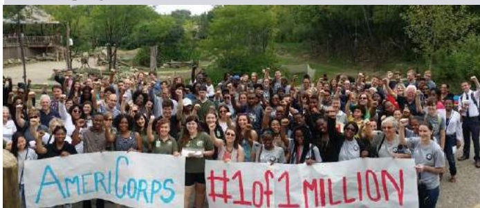
Ohio AmeriCorps members

Similar to signing up for the Peace Corps in your own community, Project Advance AmeriCorps is a great way to build communities such as Price Hill by serving as a paid AmeriCorps member. Thousands of federally supported AmeriCorps programs exist across the nation, and Santa Maria is fortunate to have been selected as one of the local host agencies to manage one such program.