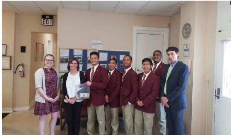
Dater High School M.O.R.E. club

School two years ago as a reactive idea to keep young men out of trouble by allowing them to serve in leadership roles and by offering new opportunities to them.