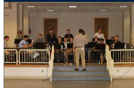
Farm League Big Band

The event featured a catered dinner by Hammann’s Catering, Deli and Butcher Shop, music by Original Farm League Big Band, and giveaways. Staff, Board, volunteers, and supporters of the agency enjoyed a night of dinner, music, and conversation while learning about the many programs of the organization.