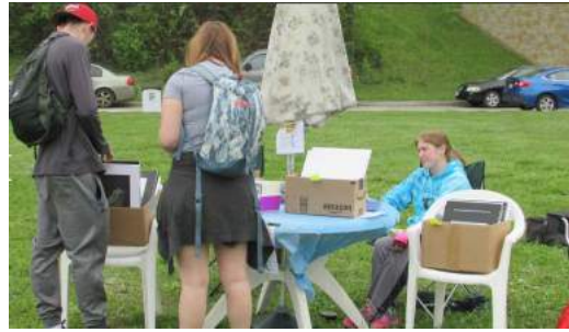
Arts ’N Smarts International Art Fair

The International Welcome Center exists to give Cincinnati’s immigrants a unique, effective and open community education and welcoming support.