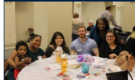
Volunteers and staff at the 2017 Volunteer Recognition Dinner

This year’s dinner was held at St. William Church and celebrated the contributions of many individuals who have volunteered for Santa Maria during the 2016 calendar year.