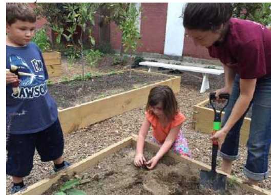
Lower Price Hill garden

apprentices’ duties will include maintaining the gardens and planning for weekly, public garden parties which take place in the Sassafras Garden Fridays from 2:30-4:30.