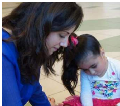
Wellness program at Santa Maria

To accomplish bridging the health gap, Santa Maria is raising funds to acquire TV