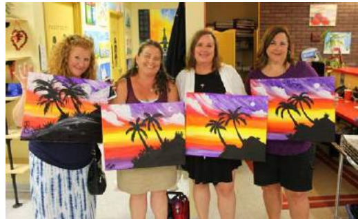
Painting with a Purpose fundraiser

Each guest left with their own painting and a Santa Maria goody bag.