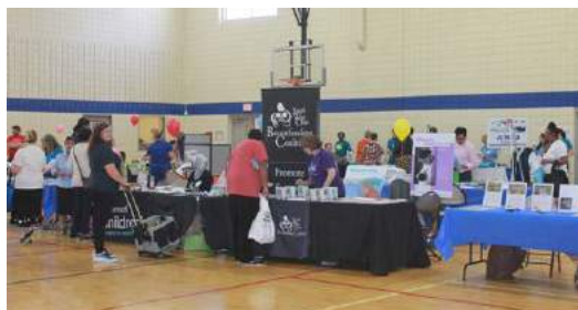
2017 Annual Spring Health Fair

Santa Maria Community Services, along with partners and funders Cincinnati Children’s Hospital Medical Center, Cincy-Cinco, and the Ohio Commission on Minority Health, held the 2017 annual Spring Health Fair on April 9 at the Price Hill Recreation Center.