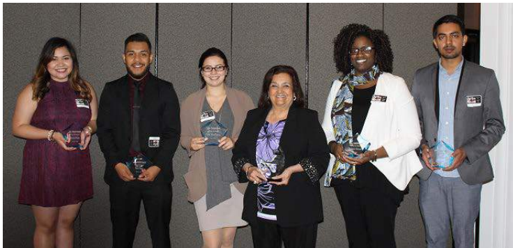
2017 Bienestar Recognition Luncheon