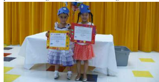
2016 POP/SPARK graduation

We are excited for our POP and SPARK graduation to take place on August 4th and 5th at Roberts Academy, which will celebrate preschoolers graduating into kindergarten.