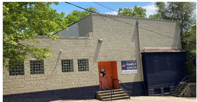
Joe Williams Family Center

Since Santa Maria's Youth Development Program's big move into the Joe Williams Family Center, (formerly Espy Boys & Girls club) four years ago, there has been great room for program growth and expansion, and although the COVID-19 pandemic caused some temporary cuts to personnel, Santa Maria continues to serve families and young people of Lower Price Hill (LPH). Beyond facilitating social/emotional skills groups for middle school students at Oyler School, Santa Maria's Youth Development Program has had the opportunity to lead various after school programs, including the start of a sports league for younger children, and reviving a Girl Scout troop. Prior to the COVID-19 pandemic, the doors to the Joe Williams Family Center (JWFC) were open four days a week, allowing us to serve more youth than ever before, providing a safe space to play basketball, make art, receive academic assistance, play board games, and mingle with their friends.