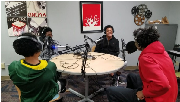
Young Voices of Cincinnati

and realizing the value of shared spaces for their neighbors. Another group of teens meet with Cincy Stories, a nonprofit organization dedicated to building community through storytelling, collecting stories from residents and staff, and producing their own podcast, "Young Voices of Cincinnati." You can find their interviews on the Podcast App ( http://bit.ly/3cukBax ). In addition to great programs, our youth plan service projects, support community gatherings, and take weekly field trips each summer.