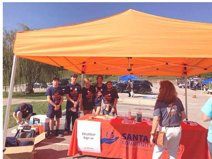
Health Fair Volunteers

What can we say? Our Santa Maria Volunteers rock!